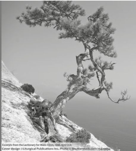
Excerpts from the Lectionary for Mass ©2005, 1998, 1970 CCD. Cover design ©Liturgical Publications Inc.

Sacrament of Baptism: Call the office for arrangements. Baptism classes are offered the 2nd Tuesday each month at St. Matthew Church. Baptisms are scheduled on Sundays during the 8:30 am Mass at St. Mary's or the 10:30 am Mass at St. Matthew Church and also at St. Matthew Church on the 4th Sunday of the month at 12 noon.