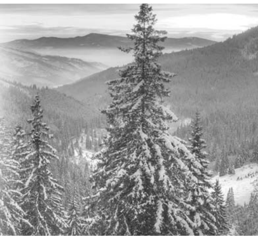
Excerpts from the Lectionary for Mass (2001), 1998, © 2002. Cover design: Liturgical Publications Inc.

Sacrament of Baptism: Call the office for arrangements. Baptism classes are offered the 2nd Tuesday each month at St. Matthew Church. Baptisms are scheduled on Sundays during the 8:30 am Mass at St. Mary's or the 10:30 am Mass at St. Matthew Church and also at St. Matthew Church on the 4th Sunday of the month at 12 noon.