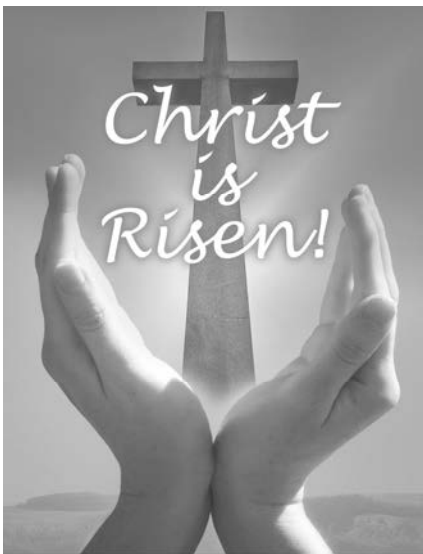
© 2007 Shogel & Shogel Publications Inc. | Photo © Shutterstock.com 7146842 and 5779321

St. Matthew: Choir, 9:30 am; 10:30 am Mass; 1st Eucharist Celebration during Mass; Coffee hour following Mass; Sr High Youth Ministry, 7-8:30 pm, HH